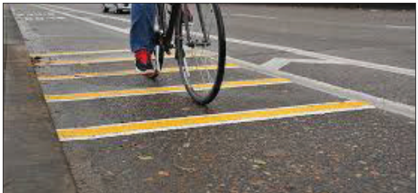
Temporary bicycle awareness decals