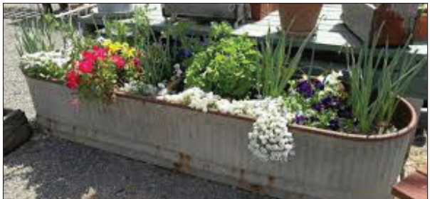
Low raised planter beds add street greenery