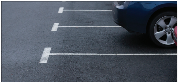
Temporary car park line marking