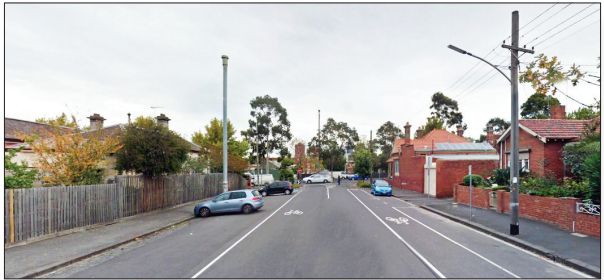
Minimal intervention to vehicle parking, pedestrian and cycle use