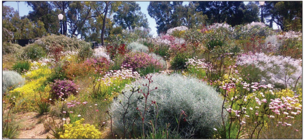
Temporary verge garden at southern end of street is planted with natives to serve as soft buffer between Station and Princes Street.